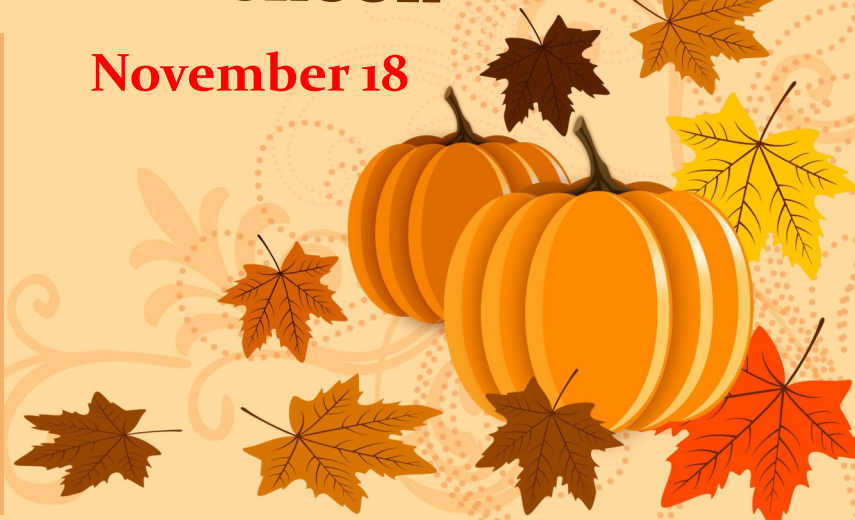
Immediately following the 11AM Sunday Service

Sign up for the Potluck Luncheon is available at The Daily Bread Café and please list what food item(s) you will be bringing.